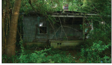
West Street (Before)