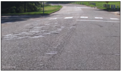
Gilliam Street (Before)