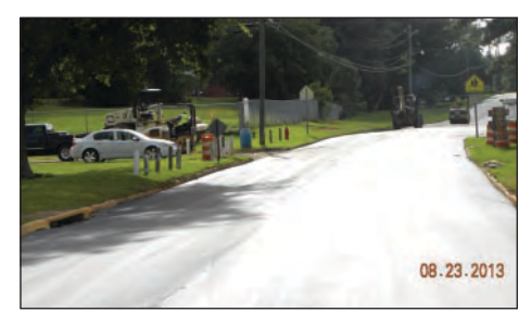
Gilliam Street (After) PAGE 3