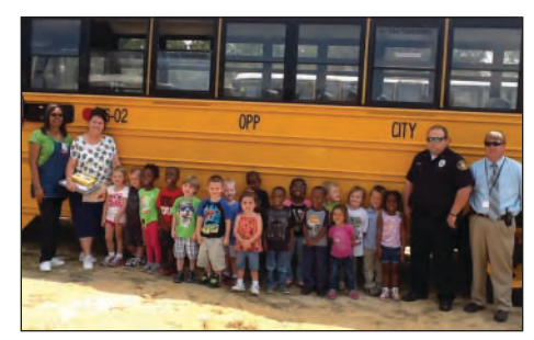
Opp Head Start Bus Transportation

Although we can not provide bus transportation for our Head Start children, the federal regulations require us to provide general transportation training. This training is a vital part of our transition from Head Start to public schools where bus transportation safety is of the utmost importance. As part of our transportation training, local public schools provide onsite training where Head Start children have an opportunity for their first onboard school bus experience.