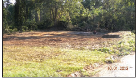
103 Girard Street (After) WINTER 2013