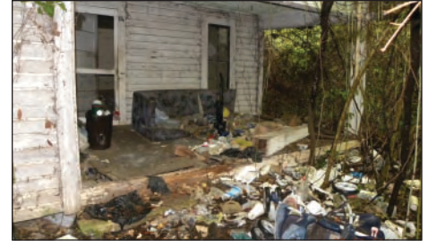
114 Hall Street (Before)

334-794-4093 ext 1411 or rarmstrong@searpdc.org