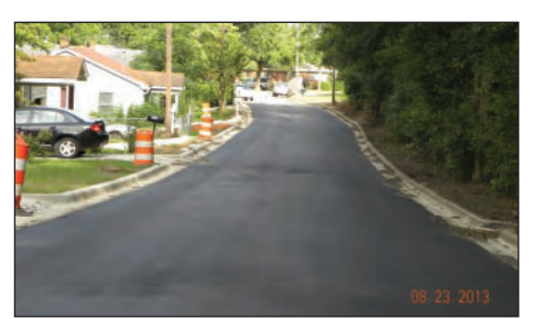
East Alabama Street (After) REGIONAL REPORT