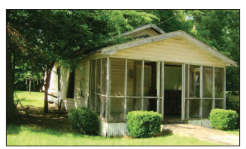
105 Jordan Street (Before)