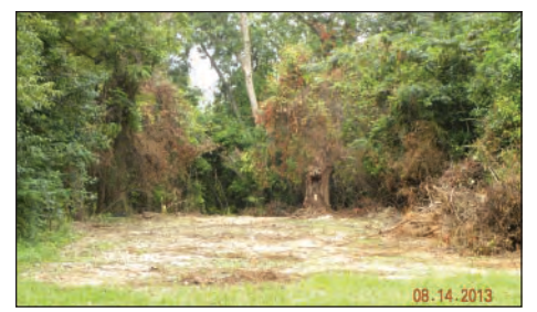
114 Hall Street (After)