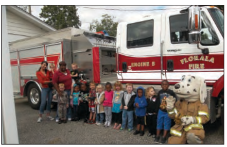
Florala Head Start learning about fire safety with Florala Fire Department

personnel to provide information pertaining to their responsibilities along with helpful personal safety tips. In recognition of Fire Safety Week our Head Start Centers were recently visited by local firemen that provided the children with fire safety activities and a fire safety check list to take home to their parents.