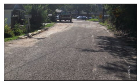
East Alabama Street (Before)