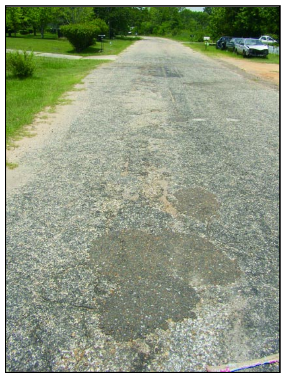
Pictured above is Friar Road before the paving project.

The Southeast Alabama Regional Planning and Development Commission (SEARP&DC) assisted the Town of Grimes with the development of the CDBG grant funding application and provided grant administration. Lewis Inc. of Headland was the general contractor and project engineering services were provided by Praestare Engineers of Dothan.