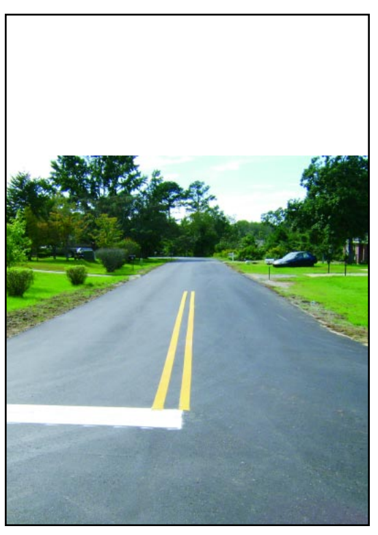
Pictured above is Friar Road after the completion of the paving project.