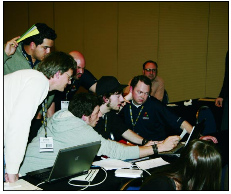
SANS Attendees at work

To find out more about SANS and GIAC please visit <u>www.sans.org</u> or <u>www.giac.org</u>.