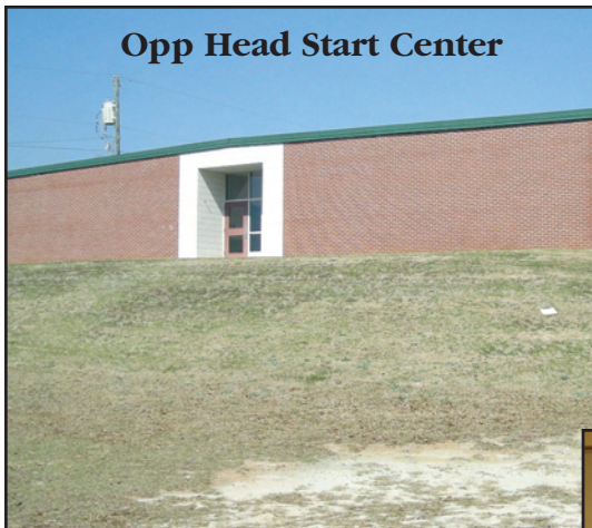
Opp Head Start Center

Opp Head Start opened its doors over 34 years ago in the old school building on Hardin Street. The building originally constructed in 1935 served our program very well