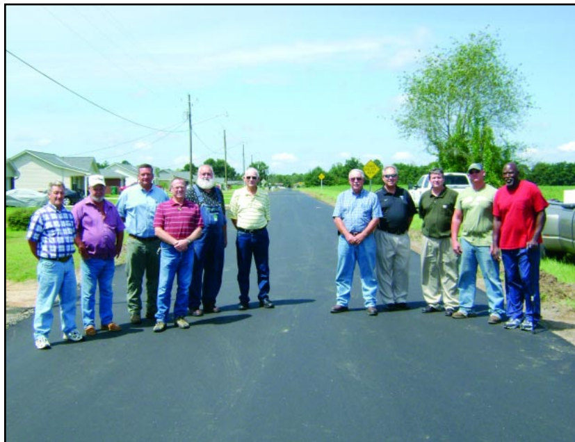
Town of Grimes and Local Officials gather to view the new street improvements in the Canterbury Subdivision along Old Town Road on September 3.