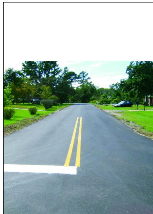
Pictured above is Friar Road after the completion of the paving project.