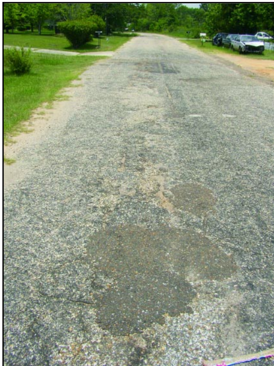
Pictured above is Friar Road before the paving project.

The Southeast Alabama Regional Planning and Development Commission (SEARP&DC) assisted the Town of Grimes with the development of the CDBG grant funding application and provided grant administration. Lewis Inc. of Headland was the general contractor and project engineering services were provided by Praestare Engineers of Dothan.